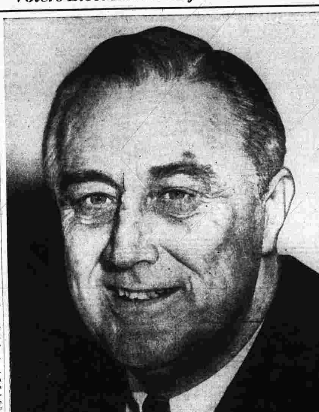
Franklin Delano Roosevelt

ROOSEVELT Winner of Sweeping Victory; Democrats Capture Connecticut Control. Election results here were reported today when the president-elect was sworn in at the White House.