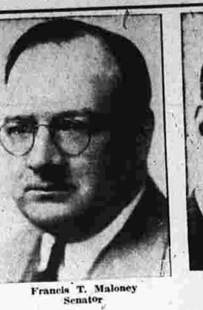
Francis T. Maloney, Senator.